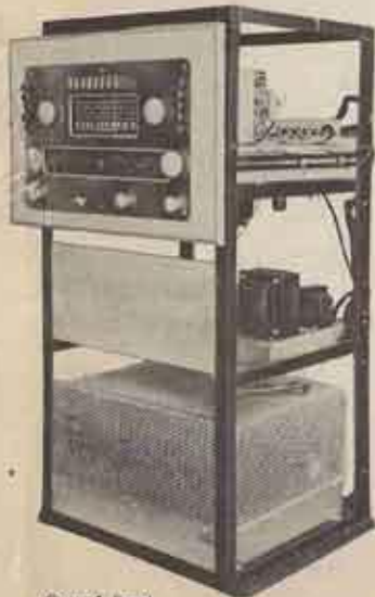
Control Panel Chassis and Frame