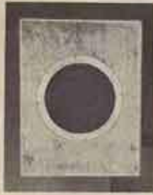
Speaker and Frame