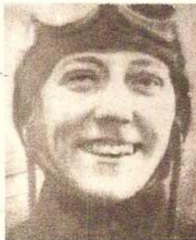
RIGHT: An electrochemical picture transmitted by radio with the Television and Radio Laboratories equipment.