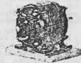
Synchronous motor 1/6 HP 1800 RPM $17.50 1/8 HP 1200 RPM $20.75

We sold lots of synchronous motors to X-ray manufacturers, experimenters, laboratories and schools. I became well known to the head of the fractional horsepower motor department of General Electric and when he found out what I was doing, he turned all inquiries for the synchronous motors over to me. G.E. would not alter their motors to run synchronous so they let me have the work and put them out under another name.