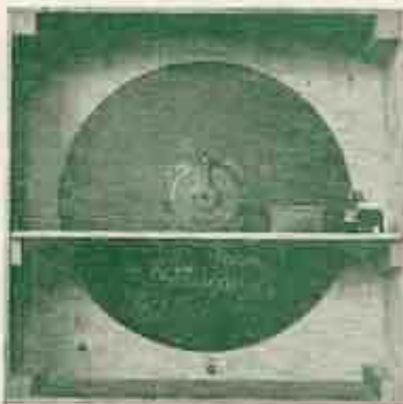
KINO-LAMP AND SCANNING DISC MOUNTING

The plates are brought out to the "plate" and "filament" prongs. The plate terminal of the tube socket into which the neon lamp is fitted should be connected to the plate of the 171. The filament terminal should connect to the current limiting resistor.