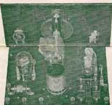
THE SHORT WAVE TELEVISION RECEIVER

Noise does not present the same limitations in a television receiver that it does in a broadcast receiver. Any noise is bothersome if you must listen to it, but in a picture it is represented by black spots and streaks that appear in a continually shifting position unless it is a periodic noise.