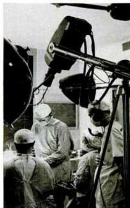
REMOTE-CONTROL CAMERA, designed by CBS especially for use in the televising of surgery, gets unobstructed view of operation from its position above table.

application. This joint effort was aimed primarily at producing a new method of visual education for the medical profession. But the very existence of a practical color television system, even of a restricted, closed-circuit type, inevitably raised the question of when color television will be available to the general public. The answer must come from the Federal Communications Commission, which has considered this and other color systems but so far has licensed none. Two years ago the commission turned thumbs down on the CBS method on the grounds that it had not been sufficiently developed and tested. At that time CBS color television could not be received on standard sets. It could not be transmitted over standard channels and its quality needed some improvement. Since that time CBS has altered its color system so that telecasts can be transmitted on any channel and (by the use of a rather bulky adapter) be received on existing sets. As for present quality, it would seem that any color television good enough to give doctors a satisfactory view of the vital organs ought to be good enough to give the public a satisfactory view of Arthur Godfrey's red hair.