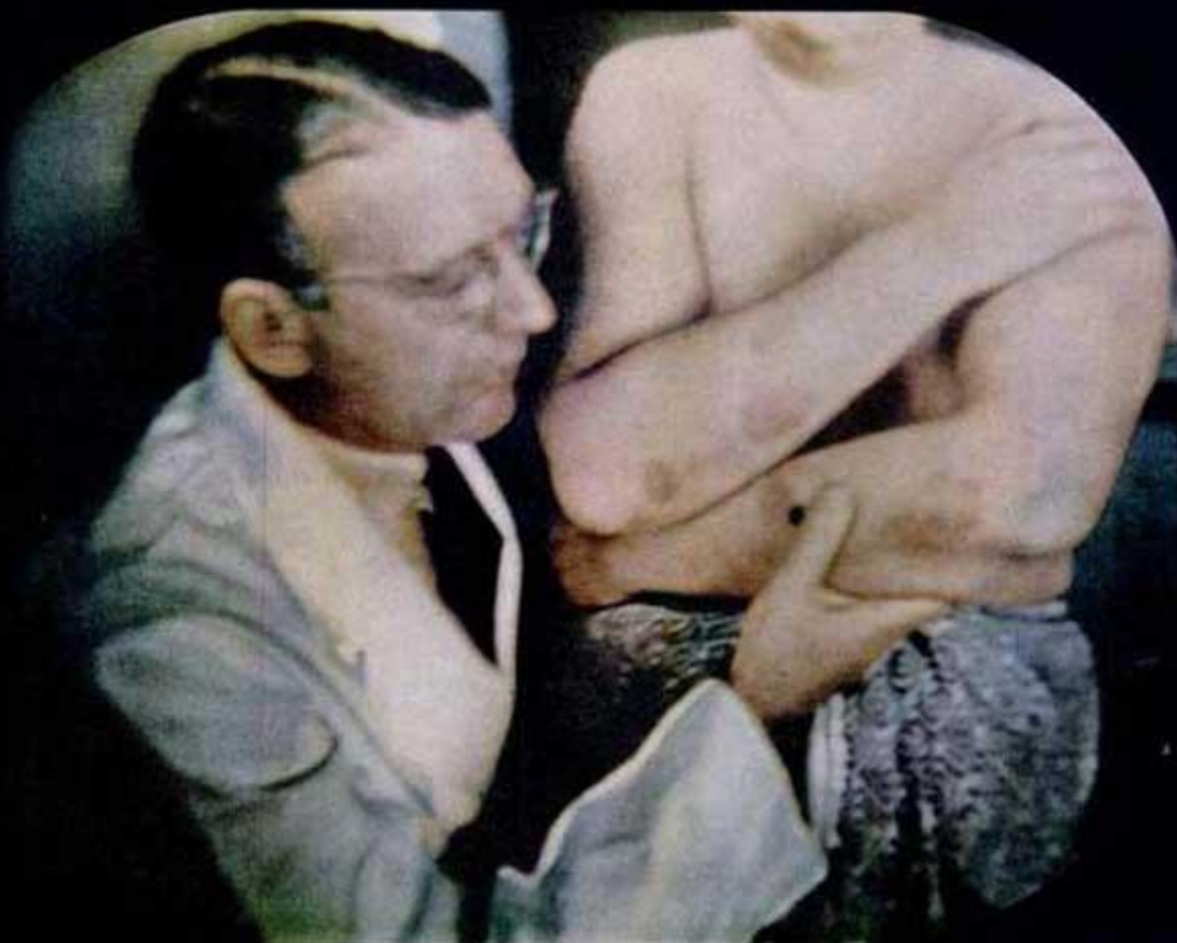
INFLAMED SKIN IS DIAGNOSED FOR DOCTOR AUDIENCE AS HARD-TO-CURE PSORIASIS