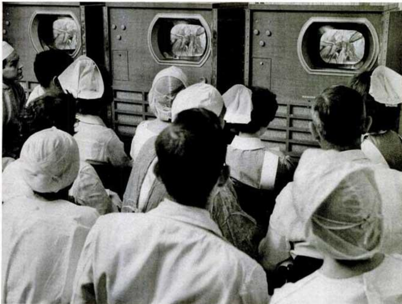
NURSES AND DOCTORS SEE AN OPERATION TELEVIEWED IN COLOR AT UNIVERSITY OF PENNSYLVANIA HOSPITAL, WHERE THE EQUIPMENT WAS GIVEN FINAL TESTS