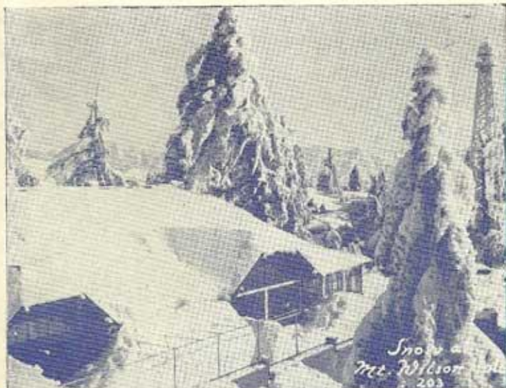
Above: Snow at Mount Wilson Hotel.

National Broadcasting Television Station KNBH open to visitors 2:00 to 9:30 P.M. daily outside gate upon presentation of red entrance ticket to Mt. Wilson Park.