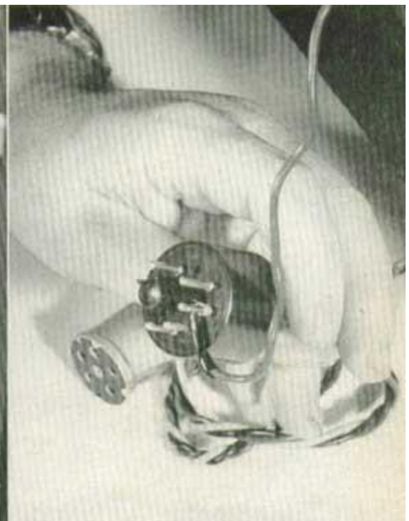
THREE CONNECTIONS hook a voltage divider up to the horizontal output tube. Solder the free lead of the ceramic condenser directly to the plate cap, as above. The orange lead from the converter goes to the joint between the two 2-watt resistors and the ½-watt resistor. The lower end of the latter and the black converter lead are grounded to the cabinet frame.