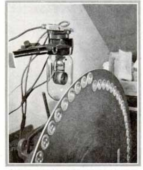
Fig. 4. Detail showing the crater neon lamp and the top of the spiral of tiny lenses. The disk rotates clockwise

Well, that gives you the theoretical width of the image, and five sixths of that gives the theoretical height of the image, which is equal to the pitch of the spiral. You know what the five sixths is, don't you?" Don asked.