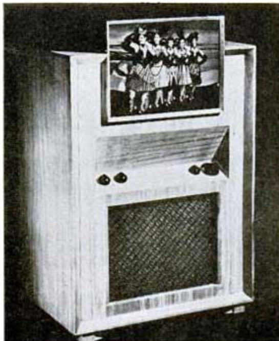
Cabinet type of projection set will be most common. In some the viewing screen folds into the cabinet. This Fisher model sells for $795.