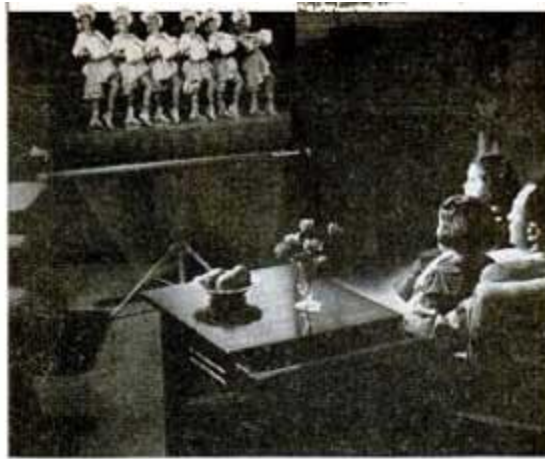
Image is thrown onto an external screen by the Ansley Tele-Movie®. Optical system is similar to unit shown below. Set costs $795.

The projector is a modification of the Schmidt-type optical system. Most of the receivers in which it will be used will employ 12- by 16-inch viewing screens in the cabinet; a few will use the projector to throw a three- by four-foot image onto an external screen.