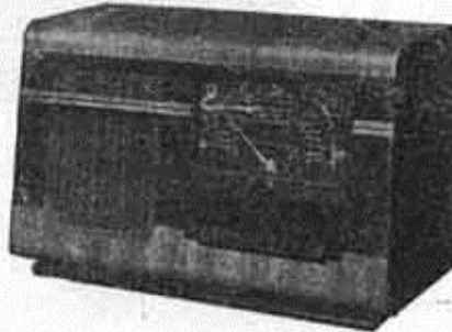
Table Model 166. We count this instrument among our finest achievements. With its 10in. loudspeaker and acoustically-correct cabinet it approaches very near to the total perfection of the larger R.G.D. instruments. 16 gns.