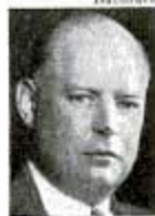
DR. DU MONT... President of the Allen B. DuMont Laboratories, Inc.; past president of Television Broad- casters Association. He is a member of the Rotary Club of Montclair, N. J.

We have no assurance that high-frequency television ever will be satisfactory. Experiments made point to difficulties for which no solutions are now in sight. In New York, for example, only 15 percent of the people between a transmitter