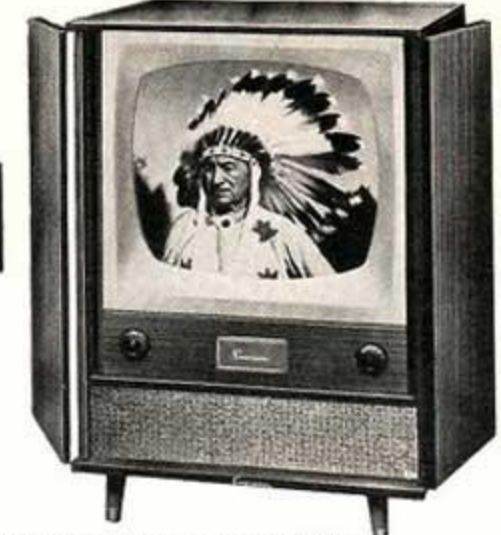
Fig. 3. The full door console is the model C502C. The nameplate covers the necessary color controls.