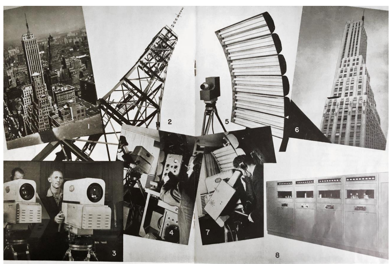
ression transmitter W2XWV and its localities, ready to "ge on the ut": skysemper. (3) A battery of latest model for the new and single state. Do Mont Ledestian concerns owne dominates the milliours skyline and outside programs. (4) Careful monilocality of 50 fleet above the side. (2) Seed tower supports the aninsuges of fine pictorial quality. (5) Banks

ont New York Television Station W2XWV of fluorescent langs provide cool, comfort view finder creables Du Mont above the performers. (6) Studies are located on the performers. (6) Studies are located on the defection terms (8) The performers with the standard fluor of this connecticutly studies and under transmitting equipments of the standard fluor of this connecticutly studies and the standard middluor skyscraper. (7) The electronic area.