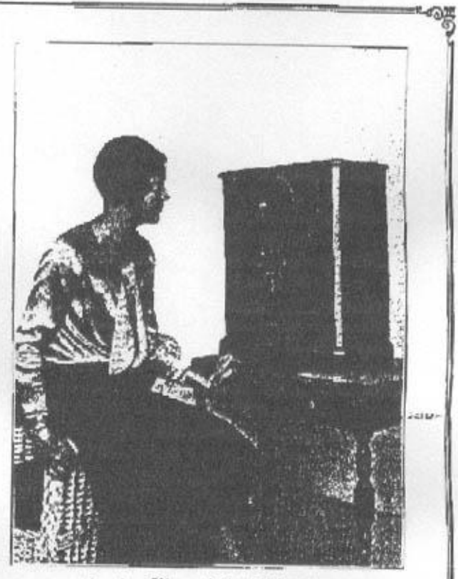
Another View of the Visionette.

The forty-five aperture three spiral scanning disk, using the multiple spiral principle, is made of thin aluminum, specially ribbed to assure sufficient stiffness to withstand the rotation. It is mounted accurately on a die cast hub with a bushing rapered to fit the tapered shaft of the motor. The hub has two threaded holes to allow the convenient removal of