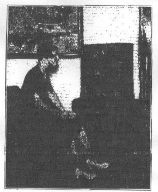
Looking Into the Visionecte.

N EVER before has the radio experimenter been offered a field so vitally interesting and rich in profitable experience. Thrills undreamed of await the experimenter equipped to receive pictures from the air. Almost every field of science has been tapped to bring the achievement of television to its present state. The opportunities for further experiment are innumerable. Experiment in radio, in optics, in electrical engineering, in mechanics, is open to the same group which has helped to bring about the improvements in Radio with such bewil-