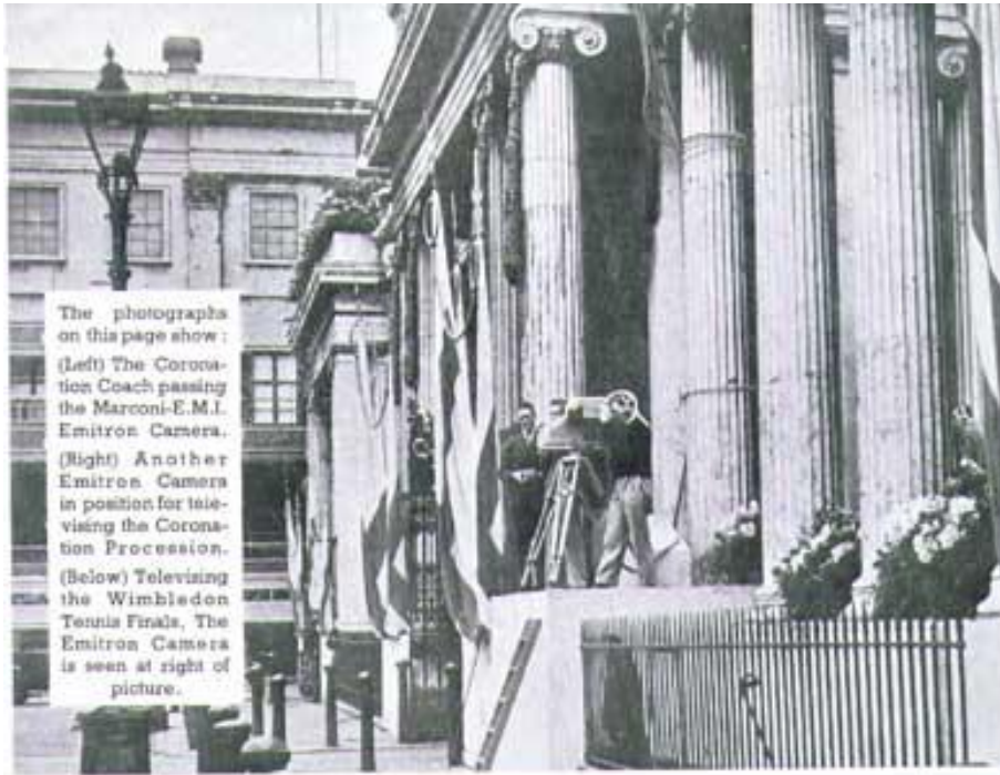
The photographs on this page show: (Left) The Coronation Coach passing the Marconi-E.M.I. Emitron Camera. (Right) Another Emitron Camera in position for televising the Coronation Procession. (Below) Televising the Wimbledon Tennis Finals. The Emitron Camera is seen at right of picture.