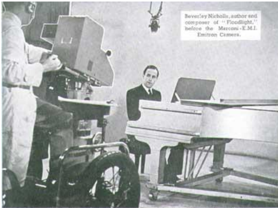
Beverley Nicholls, author and composer of "Floodlight," before the Marconi-E.M.I. Emitron Camera.