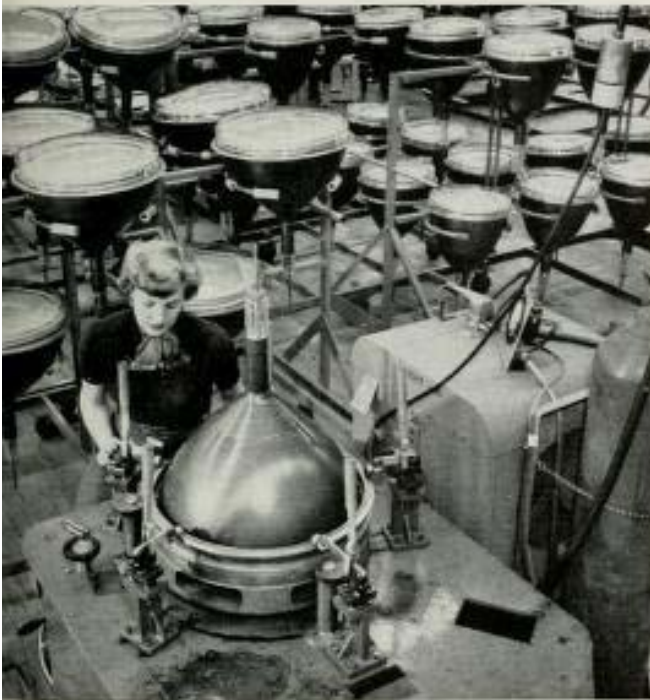
Welding a 19-inch tricolor tube at the Lancaster, Pa., RCA plant, where tube is in pilot production.