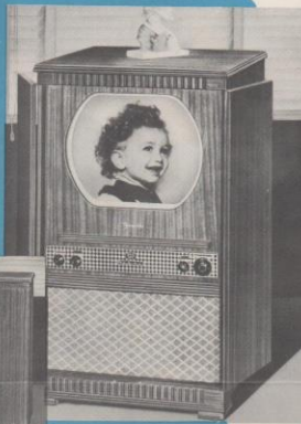
DE LUXE MODEL 19C31: 19-in. Direct-View Tube with colorial 205-sq. in. Screen. Super-Powered 31-tube Chassis with Voltage Doubler and Keyed Automatic Gain Control. Auditorium size 12-in. Alnico PM Speaker. Noise-free FM sound. Power Transformer for extra safety. Handsome cabinet of fine Mahogany veneers, full opening doors.