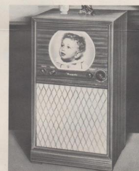
MODEL 120B: 12½-in. Direct-View Tube with giant Wide-View 91 sq. in. Screen. Ultra-powerful RCA licensed circuit. Auditorium size 12-in. EM Dynamic Speaker. Automatic Gain Control assures uniform picture contrast. Power Transformer for Extra Safety. Mahogany veneer cabinet.

ADVANCED REGAL FEATURES MAKE REGAL TELEVISION YOUR BEST BUY IN EVERY TUBE SIZE ... ASK YOUR DEALER FOR A DEMONSTRATION