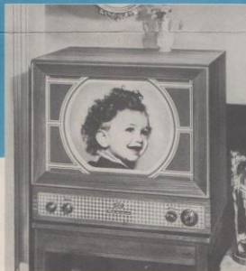
DE LUXE MODEL 16T31: 16-in. Direct-View Tube with Life-Size 140-sq. in. Screen. Super-Powered 31-tube chassis with Voltage Doubler for greater picture brilliance and Keyed Automatic Gain Control. Big 7-in. oval Alnico PM Speaker. Noise-free FM sound. Handsome Mahogany veneer cabinet.