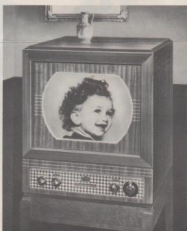
MODEL 160T: 16-in. Direct-View Tube with Life-Size 140-sq. in. Screen. Powerful RCA Licensed circuit. Automatic Gain Control assures uniform picture contrast on all channels. EM Dynamic Speaker. Noise-Free FM sound. Compact styled cabinet of fine grain Mahogany veneers.