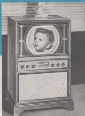
DE LUXE MODEL CD36 WITH AM-FM RADIO: 16-in. Direct-View Tube with Life-Size 140-sq. in. Screen. Super-Powered 36-tube Chassis with Voltage Doubler and Keyed Automatic Gain Control. AM Radio Band, 535 to 1650 KC. FM Radio Band, 88 to 108 MC. Phonograph Plug-In Switch. Auditorium size 12-in. Alnico PM Speaker. Noise-free FM sound. Handsome Mahogany veneer cabinet.

SENSATIONAL NEW REGAL 12½, 16 AND 19-INCH MODELS THAT LEAD IN PERFORMANCE AND VALUE