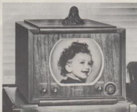
MODEL 120T: 12½-in. Direct-View Tube with giant 91-sq. in. Wide-View Screen. Ultra-powerful RCA licensed circuit. Automatic Gain Control assures uniform picture contrast on all channels. Synchronized oval 6-in. EM Dynamic Speaker. Noise-free FM sound. Smart Mahogany veneer cabinet.