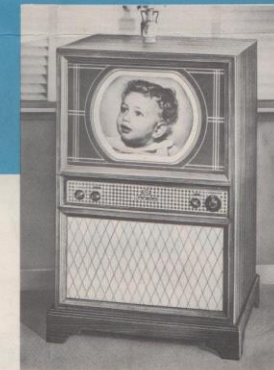
DE LUXE MODEL CD31: 16-in. Direct-View Tube with Life-Size 140-sq. in. Screen. Super-Powered 31-tube Chassis with Voltage Doubler and Keyed Automatic Gain Control. Auditorium size 12-in. Alnico PM Speaker with concert hall tone quality. Noise-free FM sound on all channels. Beautiful Mahogany veneer cabinet.