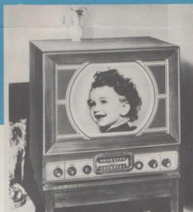
DE LUXE MODEL 16T36 WITH AM-FM RADIO: 16-in. Direct-View Tube with Life-Size 140-sq. in. Screen. Super-Powered 36-tube Chassis with Voltage Doubler and Keyed Automatic Gain Control. AM Radio Band, 535 to 1650 KC. FM Radio Band, 88 to 108 MC. 7-in. oval Alnico Speaker. Mahogany veneer cabinet.