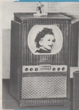
DE LUXE MODEL 19C36 WITH AM-FM RADIO: 19-in. Direct-View Tube with colorial 205-sq. in. Screen. Super-Powered 36-tube Chassis with Voltage Doubler and Keyed Automatic Gain Control. AM Radio Band, 535 to 1650 KC. FM Radio Band, 88 to 108 MC. Phonograph Plug-In Switch. Auditorium size 12-in. Alnico PM Speaker. Cabinet of fine Mahogany veneers, full opening doors.