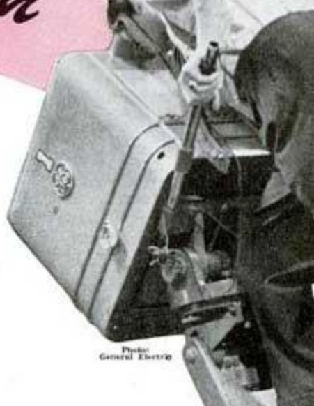
the actual subject, motion pic-

Sound broadcasting has not been particularly successful in getting any substantial portions of the advertising budgets of department stores and similar retail services. Television, as a demonstration sales medium, may be