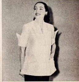
A winged, patch-pocket, short-sleeved Avorn jacket of white embossed cotton. The navy cotton broadcloth skirt has a kangaroo opening for fit and comfort.