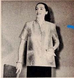
A longer silk organdy Avorn jacket plaited with tarnish-proof gold thread. It can be worn with street-length or long skirts, or slacks for home entertaining.