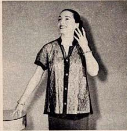
A rhinestone-studded evening jacket of black lace over nude taffeta. The kangaroo skirt is of black tissue faille, cut out with a tab to help hold it smooth.